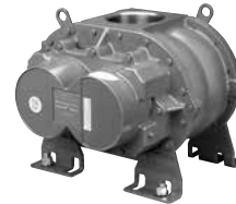
Horizontal gear end