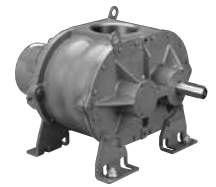
Horizontal drive end