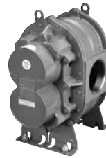
Vertical gear end

ROOTS™ Universal RAI® blowers are warranted for two years plus an additional 6 months for shipping and construction where required. ROOTS synthetic oil is recommended for longer lubricant life.